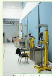
Shock Absorbing Capacity