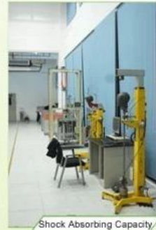
Shock Absorbing Capacity