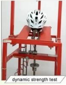
dynamic strength test