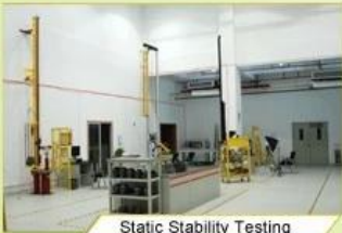
Static Stability Testing