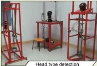
Head type detection