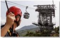
Cable car maintenance