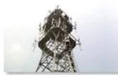
Mobile plant maintenance