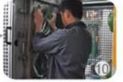
In-mold producing process