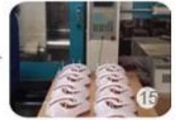
Plastic injection workshop