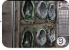
9 In-mold tooling