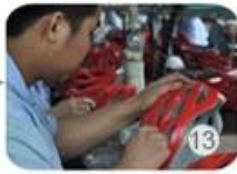
13 Helmet grinding