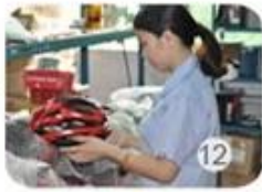
12 IQC inspection