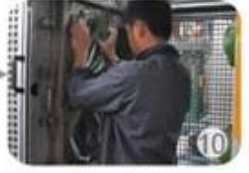
10 In-mold producing process