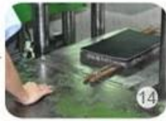
14 Inner padding production