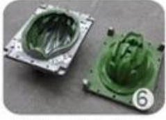
6 EPS in-mold tooling