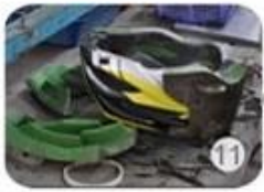
11 semi-finished In-mold helmet