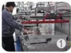
1 Silk screen