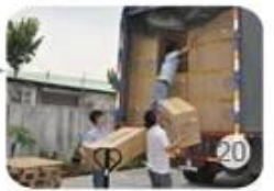
20 Installed counters