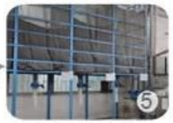
5 Eps raw material by different density