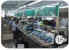
16 Assembly line