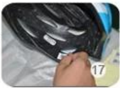
17 Inside labeling