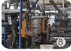
8 In-mold machines