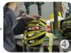
Trimming dug hole