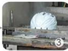
PC blister manufacture