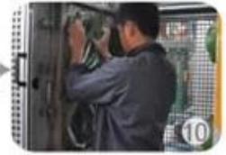
In-mold producing process