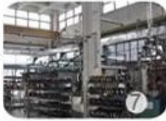
Helmet in-mold workshop