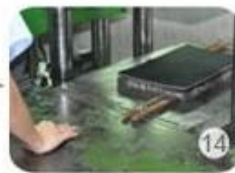
Inner padding production