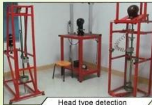
Head type detection