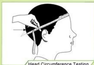
Head Circumference Testing