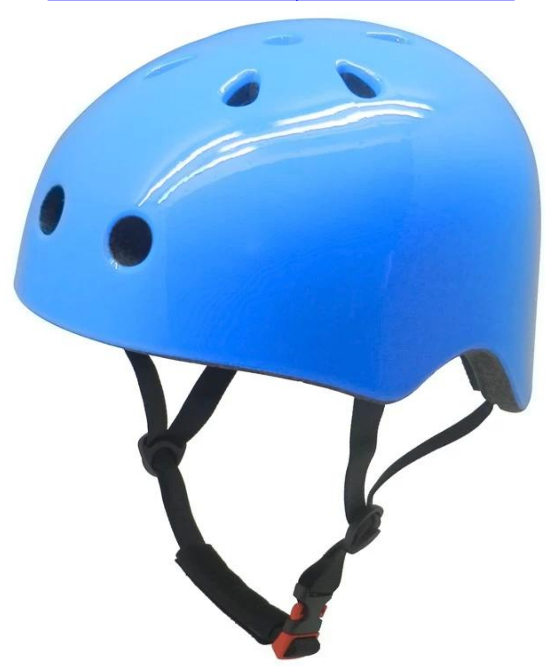
AU-K003 PC inmold skateboard, kids scooter skate helmets