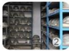
PC blister tooling