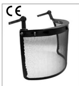
Iron mesh faceshield EN 1731

3) Safety helmet with plastic visor The set is compatible with ours special visor and earmuffs : Visor Plastic with an eye Protection, Earmuffs .