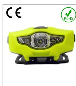
Versatile LED headlight 1A EN 55015: 2006

The detailed pictures of the safety helmet: