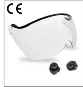
New deve loped clear visor EN266