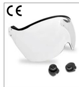
New deve loped clear visor EN266