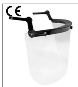
EN 166 ANSI Z87.1