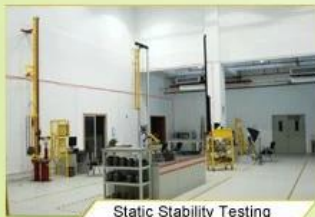
Static Stability Testing

The finished product, helmets at Aurora is then tested and qualified to export to the world.