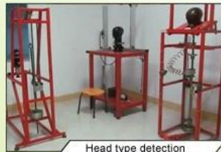
Head type detection