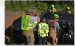
Rescue and evacuation