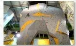
Big wall climbing