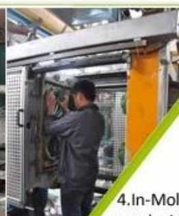
4. In-Mold producing process