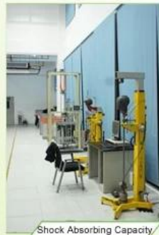
Shock Absorbing Capacity