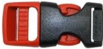
ITW standard helmet buckle