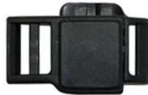
Fidlock magnetic buckle

We can also customize various colors buckle.