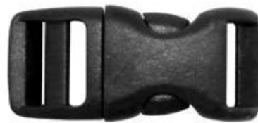
Traditional helmet buckle