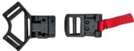
Patent self-developed magnetic buckle