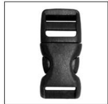
Traditional helmet buckle