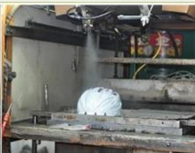
3. PC blister tooling