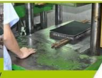
7. Inner padding Production