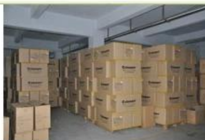
9. finished helmet

Aurora Sports is a helmet manufacturer, with more than 15 years experience in producing all types of helmets. In-house design and R&D teams with established experience, allows Aurora Sports to quickly answer to demanding requirements and create from scratch whole programs and collections with rigorous quality standards.