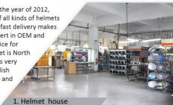
1. Helmet house

Shenzhen Aurora Sports Goods Co., LTD established in the year of 2012, more than 22 years experience. Expert in production of all kinds of helmets for different sports. Excellent quality, reasonable price, fast delivery makes us get very good reputation among our customers. Expert in OEM and ODM orders. Our skilled R&D team offers one stop service for throughout customers. 99% export and our main market is North America, European, Australia, Japan etc. Your enquiry is very welcomed and we will try our utmost to help you establish solid market. We are looking for long term relationship and get win win situation.