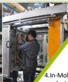
4. In-Mold producing process