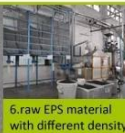
6. raw EPS material with different density