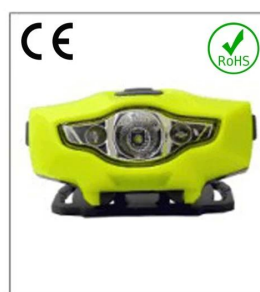
Versatile LED headlight 1A EN 55015: 2006