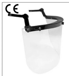
EN 166 ANSI Z87.1