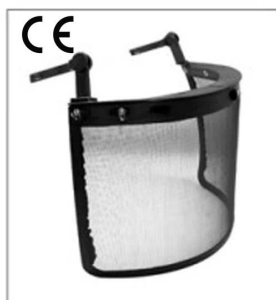
Iron mesh faceshield EN 1731