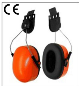
Noiseproof earmuff EN 352-3:2002