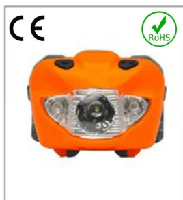
Versatile LED headlight 3A EN 61547:2009