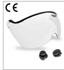
New deve loped clear visor EN266