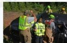
Rescue and evacuation