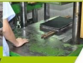
7. Inner padding Production