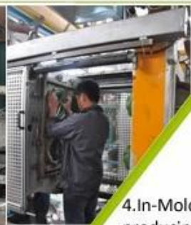
4. In-Mold producing process