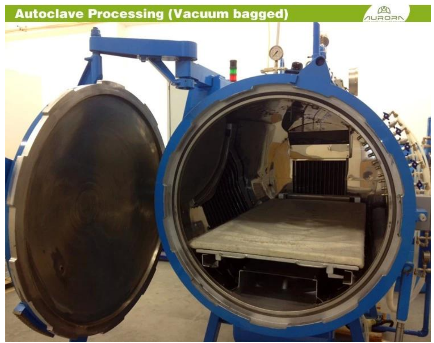
3. Trimming & Painting Area