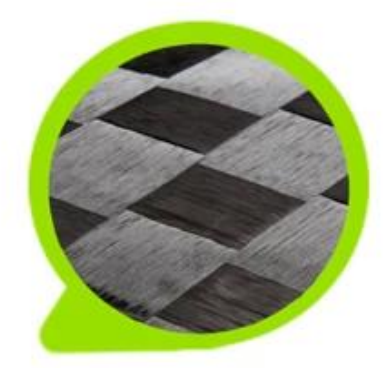
1k Tow Spread Tow