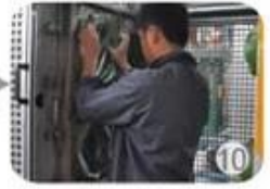
In-mold producing process