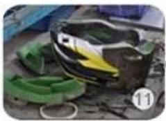
semi-finished In-mold helmet