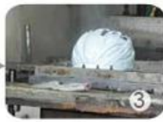
PC blister manufacture