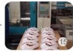
Plastic injection workshop