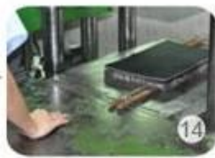
Inner padding production