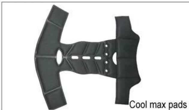
Cool max pads