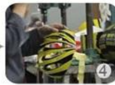
Trimming dug hole