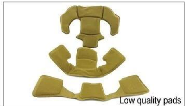
Low quality pads

There are different kinds of inner pads for your choice.