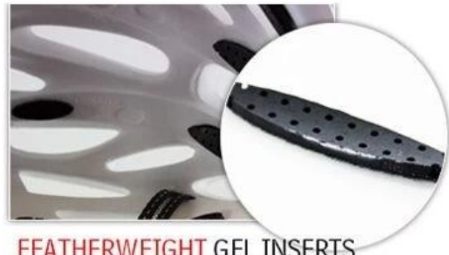
FEATHERWEIGHT GEL INSERTS