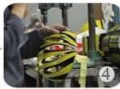
Trimming dug hole