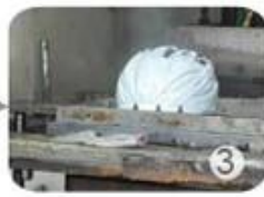
PC blister manufacture