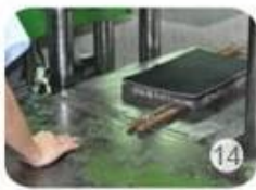
Inner padding production