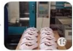
Plastic injection workshop