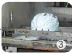
PC blister manufacture