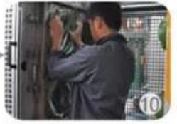
In-mold producing process