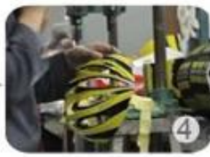
Trimming dug hole