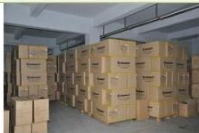
9. finished helmet

Aurora Sports is a helmet manufacturer, with more than 15 years experience in producing all types of helmets. In-house design and R&D teams with established experience, allows Aurora Sports to quickly answer to demanding requirements and create from scratch whole programs and collections with rigorous quality standards.