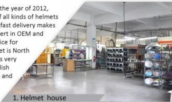
1. Helmet house

Shenzhen Aurora Sports Goods Co., LTD established in the year of 2012, more than 22 years experience. Expert in production of all kinds of helmets for different sports. Excellent quality, reasonable price, fast delivery makes us get very good reputation among our customers. Expert in OEM and ODM orders. Our skilled R&D team offers one stop service for throughout customers. 99% export and our main market is North America, European, Australia, Japan etc. Your enquiry is very welcomed and we will try our utmost to help you establish solid market. We are looking for long term relationship and get win win situation.