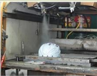
3. PC blister tooling