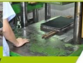
7. Inner padding Production