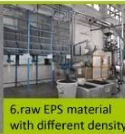
6. raw EPS material with different density