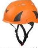
Orange pantone 165 C