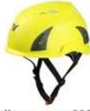
Yellow pantone 3965 U