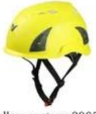
Yellow pantone 3965 U