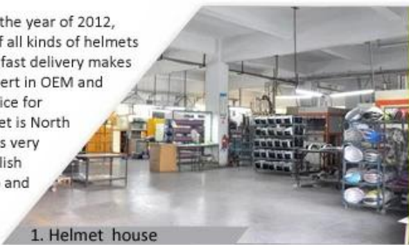
1. Helmet house

Shenzhen Aurora Sports Goods Co., LTD established in the year of 2012, more than 22 years experience. Expert in production of all kinds of helmets for different sports. Excellent quality, reasonable price, fast delivery makes us get very good reputation among our customers. Expert in OEM and ODM orders. Our skilled R&D team offers one stop service for throughout customers. 99% export and our main market is North America, European, Australia, Japan etc. Your enquiry is very welcomed and we will try our utmost to help you establish solid market. We are looking for long term relationship and get win win situation.