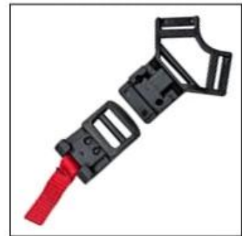
Fidlock magnetic buckle