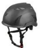
Grey pantone 432 C