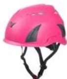
Pink pantone 806