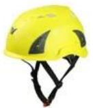
Yellow pantone 3965 U