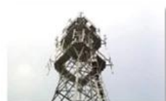
Mobile plant maintenance