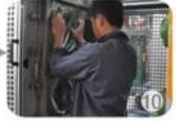
In-mold producing process