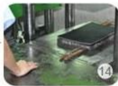
Inner padding production