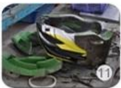
semi-finished In-mold helmet