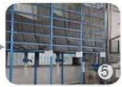
Eps raw material by different density