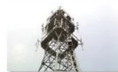
Mobile plant maintenance