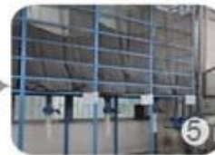
Eps raw material by different density