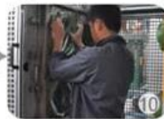
In-mold producing process