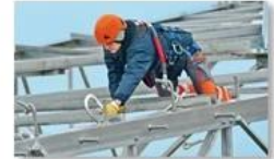
Work at height