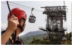
Cable car maintenance