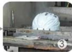
PC blister manufacture