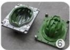
EPS in-mold tooling