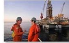
Offshore oil and gas