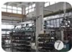
Helmet in-mold workshop