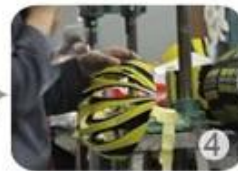
Trimming dug hole