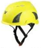
Yellow pantone 3965 U