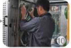
In-mold producing process