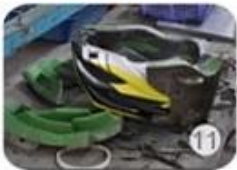
semi-finished In-mold helmet