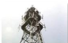
Mobile plant maintenance