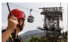
Cable car maintenance