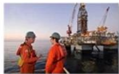
Offshore oil and gas