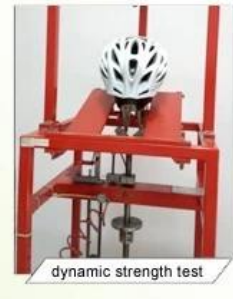
dynamic strength test