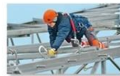
Work at height