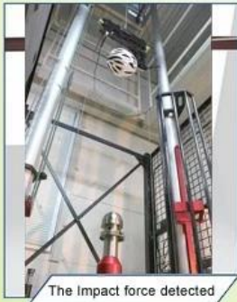
The Impact force detected