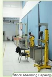
Shock Absorbing Capacity