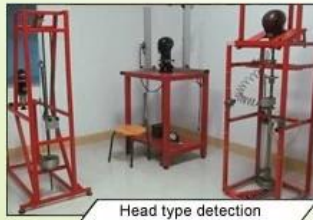
Head type detection