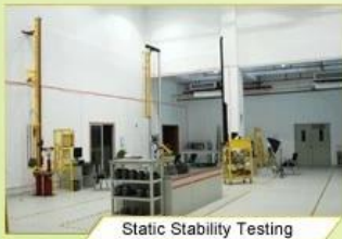
Static Stability Testing

Every manufacturing steps at AURORA follows adhere to strict quality parameters and focus on quality throughout the each stagesinvolved. All raw material and semi finished goods at AURORA pass strict quality control. The finished product, helmets at Aurora is then tested and qualified to export to the world.