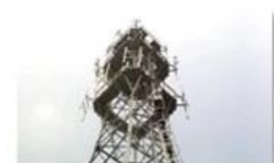
Mobile plant maintenance