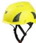
Yellow pantone 3965 U