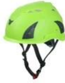
Lime green pantone 375 C