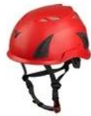
Red pantone 185 C