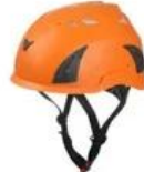
Orange pantone 165 C