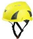
Yellow pantone 3965 U