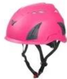
Pink pantone 806