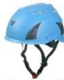
Navy blue pantone 7689 C