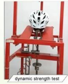
dynamic strength test