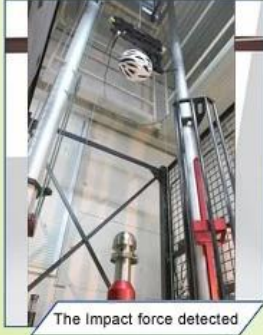
The Impact force detected