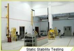
Static Stability Testing

Every manufacturing steps at AURORA follows adhere to strict quality parameters and focus on quality throughout the each stagesinvolved. All raw material and semi finished goods at AURORA pass strict quality control. The finished product, helmets at Aurora is then tested and qualified to export to the world.