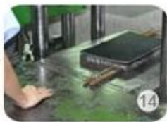
Inner padding production