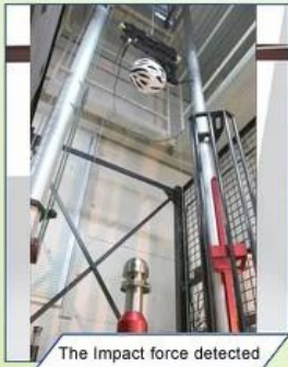
The Impact force detected