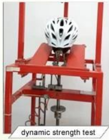
dynamic strength test