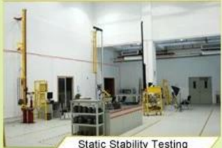
Static Stability Testing

Every manufacturing steps at AURORA follows adhere to strict quality parameters and focus on quality throughout the each stagesinvolved. All raw material and semi finished goods at AURORA pass strict quality control. The finished product, helmets at Aurora is then tested and qualified to export to the world.