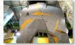
Big wall climbing