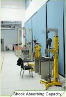
Shock Absorbing Capacity