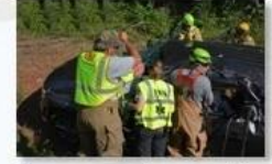
Rescue and evacuation