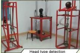
Head type detection