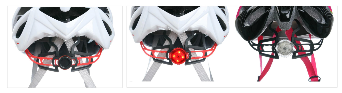
The Dial of Adjustment can be interchangeable with LED light