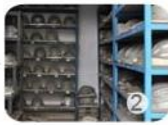
PC blister tooling