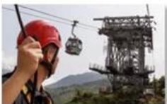
Cable car maintenance