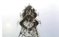
Mobile plant maintenance