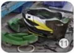
semi-finished In-mold helmet