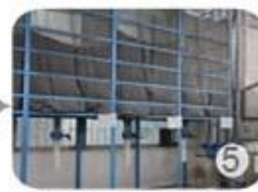
Eps raw material by different density