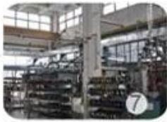
Helmet in-mold workshop