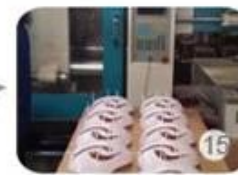
Plastic injection workshop