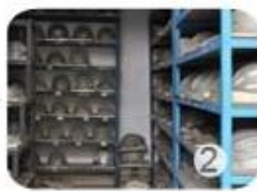
PC blister tooling