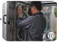
In-mold producing process