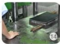
Inner padding production