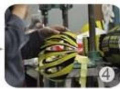
Trimming dug hole