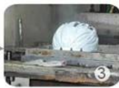
PC blister manufacture