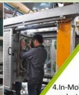
4. In-Mold producing process