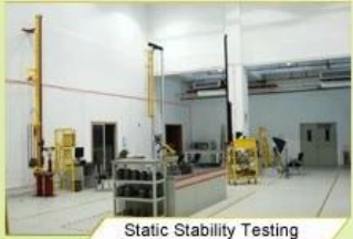
Static Stability Testing

Every manufacturing steps at AURORA follows adhere to strict quality parameters and focus on quality throughout the each stagesinvolved. All raw material and semi finished goods at AURORA pass strict quality control. The finished product, helmets at Aurora is then tested and qualified to export to the world.