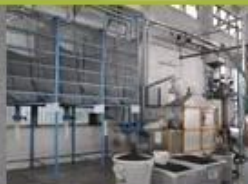
6. raw EPS material with different density