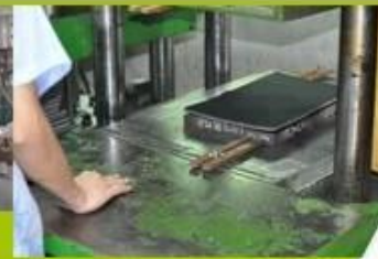
7. Inner padding Production