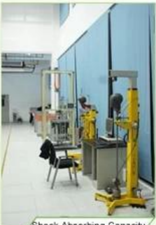
Shock Absorbing Capacity