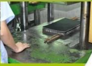
7. Inner padding Production