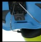
PLUG AND SOUNDPROOF EARMUFFS