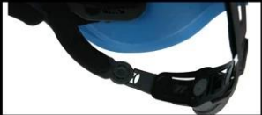
The adjustor arm can be adjustable -- DOWN