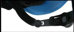
The adjustor arm can be adjustable -- UP